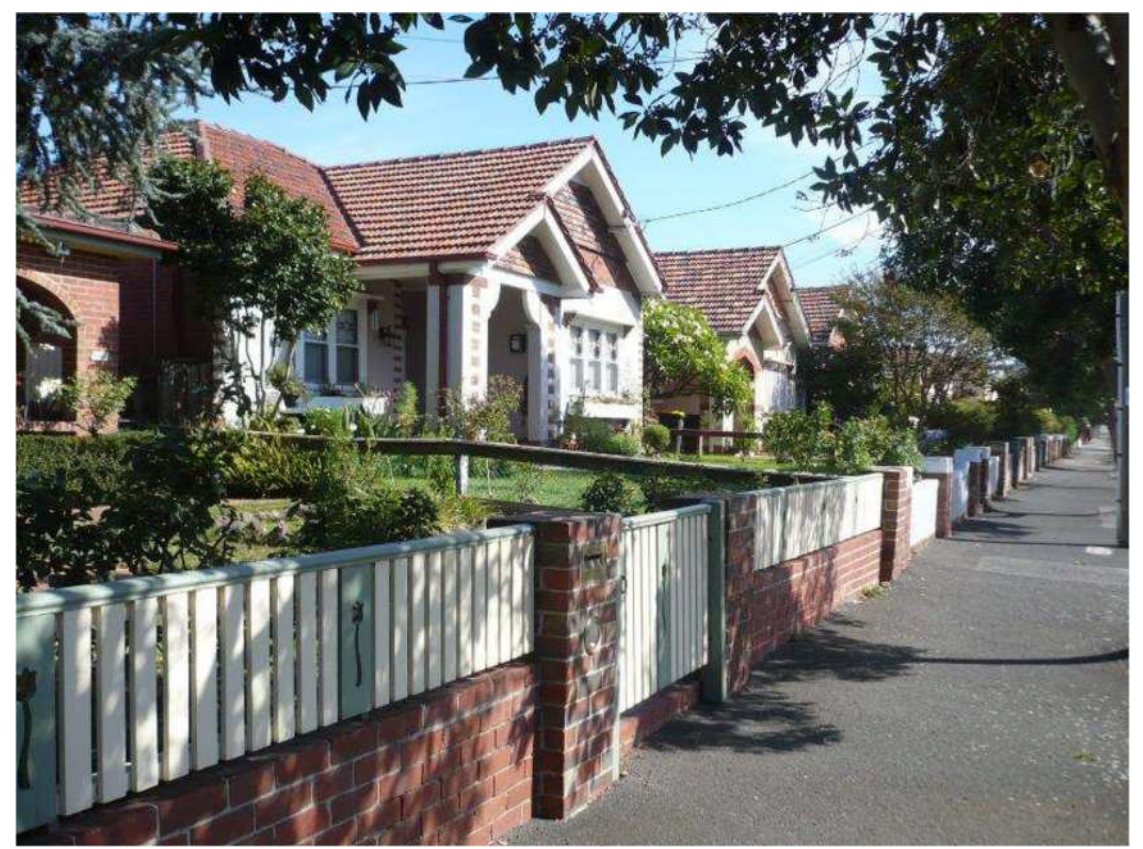
Dean Street precinct