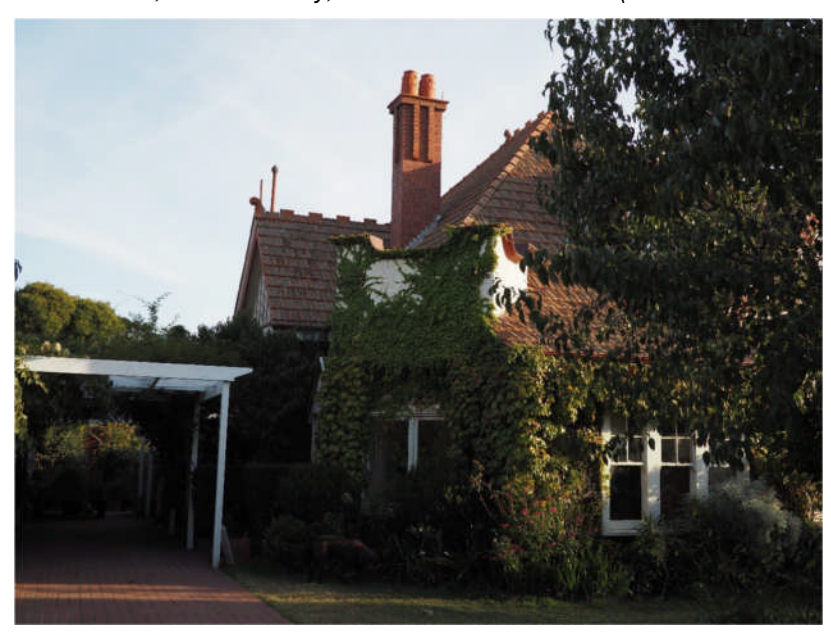
83 Holmes Road, Moonee Valley, north and east elevations