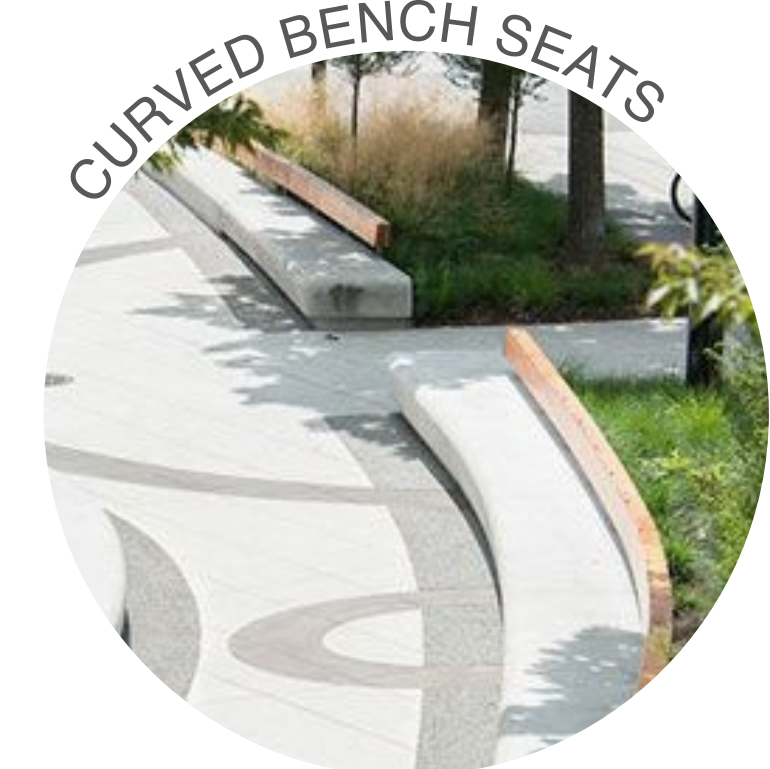
CURVED BENCH SEATS

This design will give new life to the site by providing a green oasis for the community and increase connection to the Moonee Ponds Creek Trail.