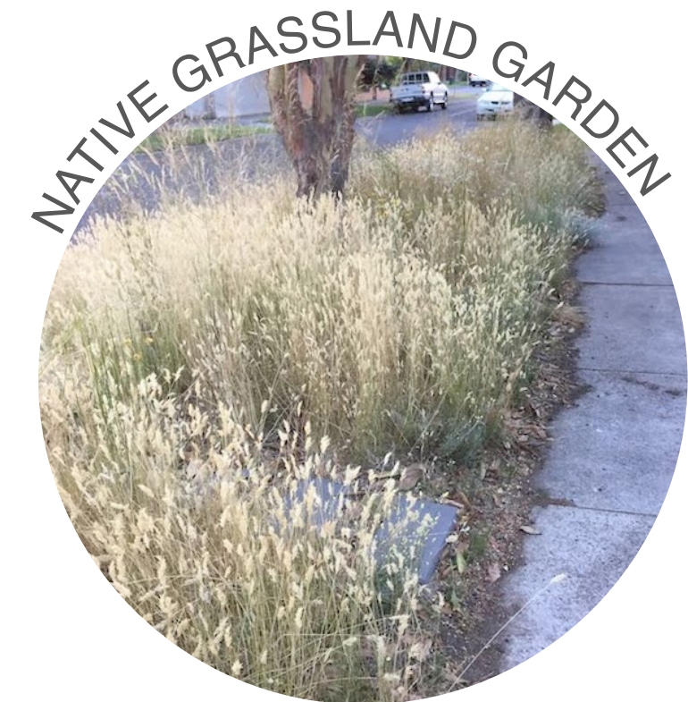
NATIVE GRASSLAND GARDEN