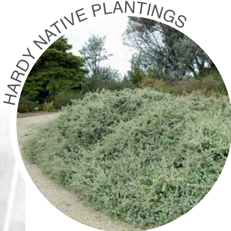
HARDY NATIVE PLANTINGS