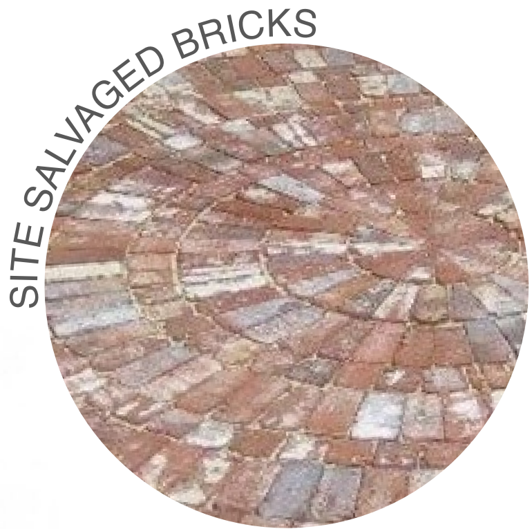
SITE SALVAGED BRICKS