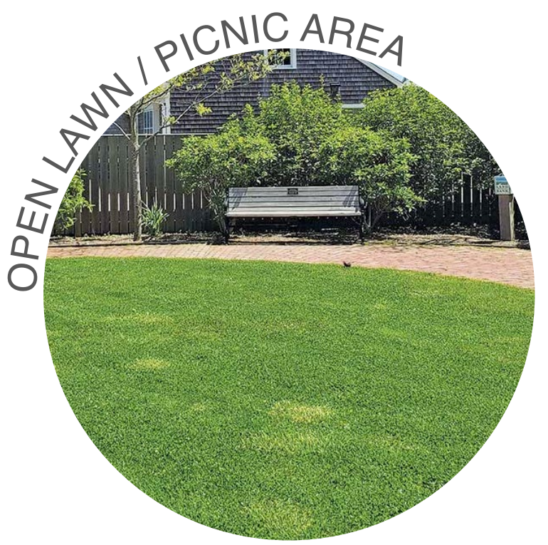
OPEN LAWN / PICNIC AREA